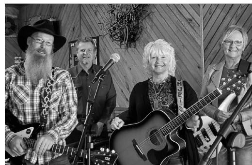
Schjei Country Sunday, June 13 @ 2:00pm